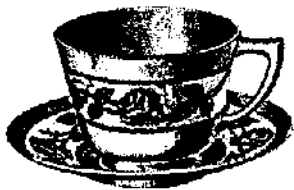
cup and saucer