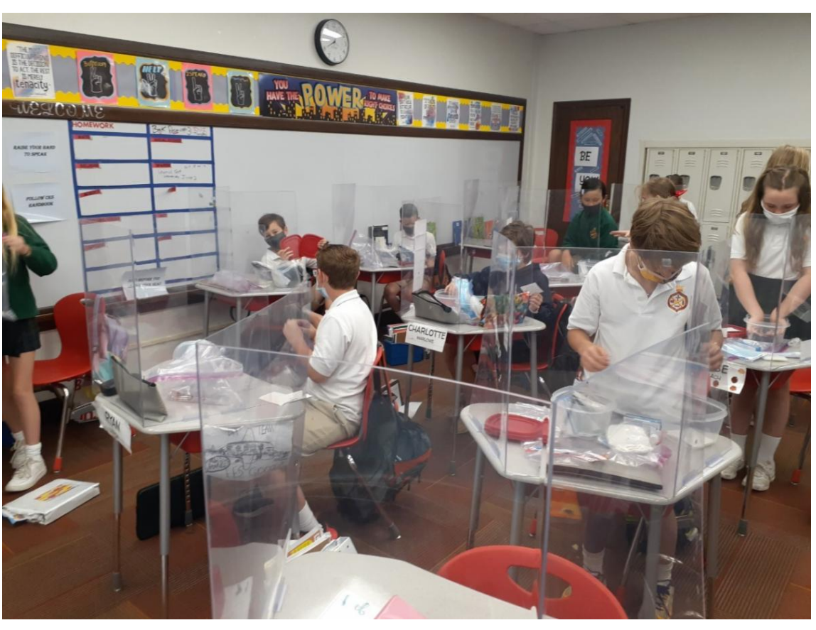
{\it Others} - The hygiene and education kits were successfully delivered to the