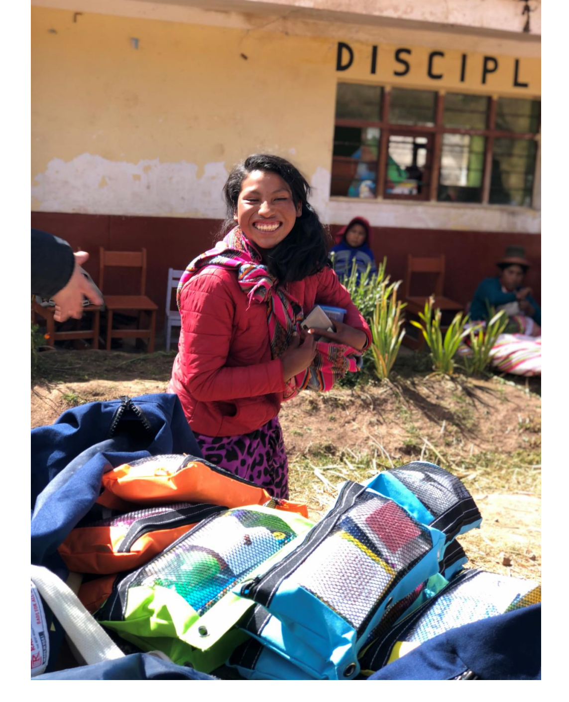
You – You made a difference by sharing your faith, hope, and joy! Thank you to our 5th & 6th graders!